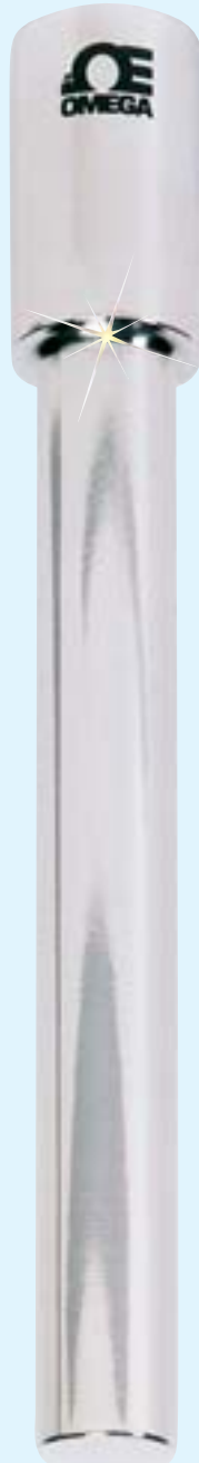
Shown smaller than actual size.

Where single values appear in the velocity tables, these may be considered safe for water, steam, air or gas. In the shorter insertion lengths, consideration is given to the velocity pressure effect of water flowing at higher velocities. The values in parentheses, therefore, represent safe values for water flow, while the unbracketed values may be used for steam, air, gas and similar density fluids.