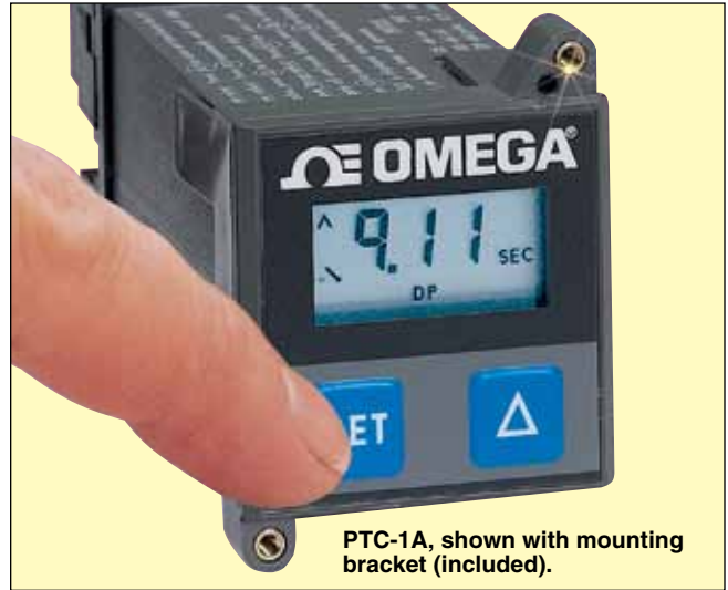
PTC-1A, shown with mounting bracket (included).

Panel Punches Available, Visit omega.com/panelpunches