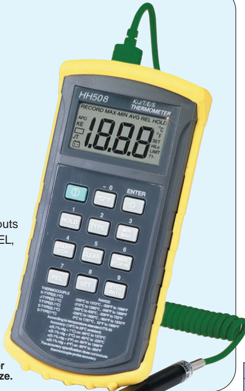
HH508, £74, shown smaller than actual size.

HH508 Single K/J/E/T/S Input Backlit LCD Accepts Type K/J/E/T/S Thermocouple Inputs MAX/MIN, AVG, REL, HOLD Functions Single Input