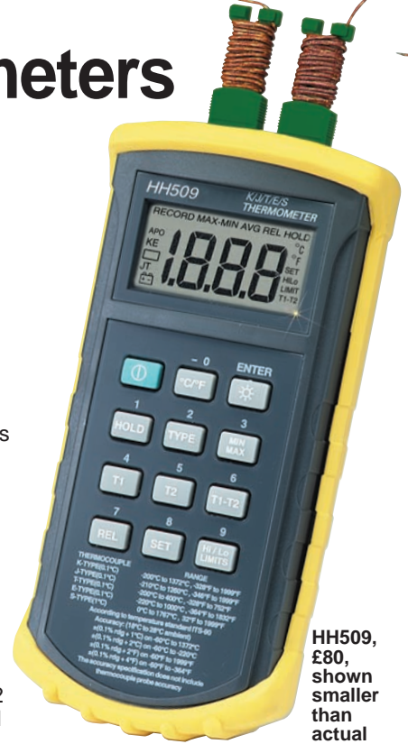
HH509, £80, shown smaller than actual size.

HH509R has all the same features as HH509 plus includes RS232 interface, cable, and software.