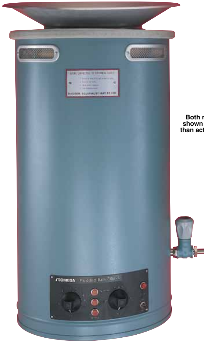
FSB-4 130 lb capacity