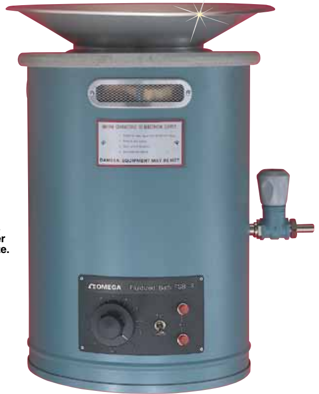
FSB-3 51 lb capacity

Both models shown smaller than actual size.