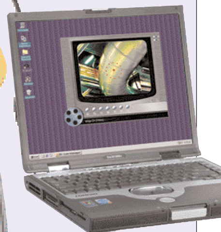
Laptop computer not included.

DV-CAM Accessory Works With All OMEGA OS Series IR Thermometers!