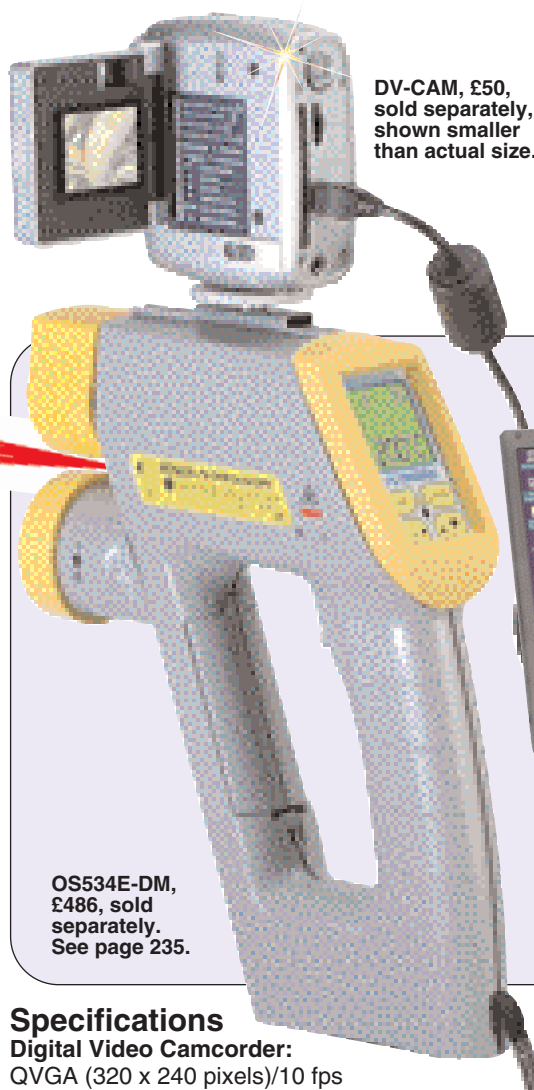
OS534E-DM, £486, sold separately. See page 235.

DV-CAM, £50, sold separately, shown smaller than actual size.