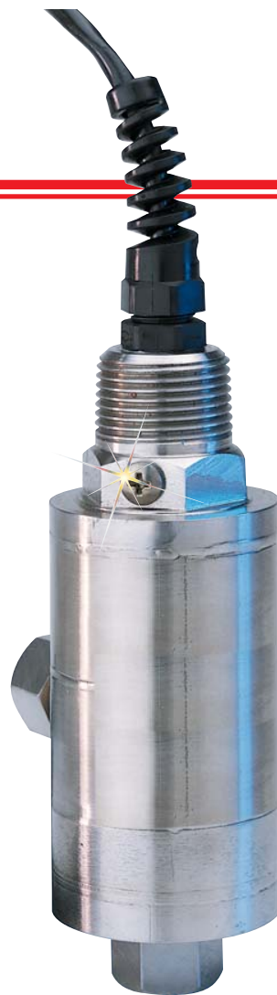
PXM81MD0-1.40BARDI, £369, shown close to than actual size.