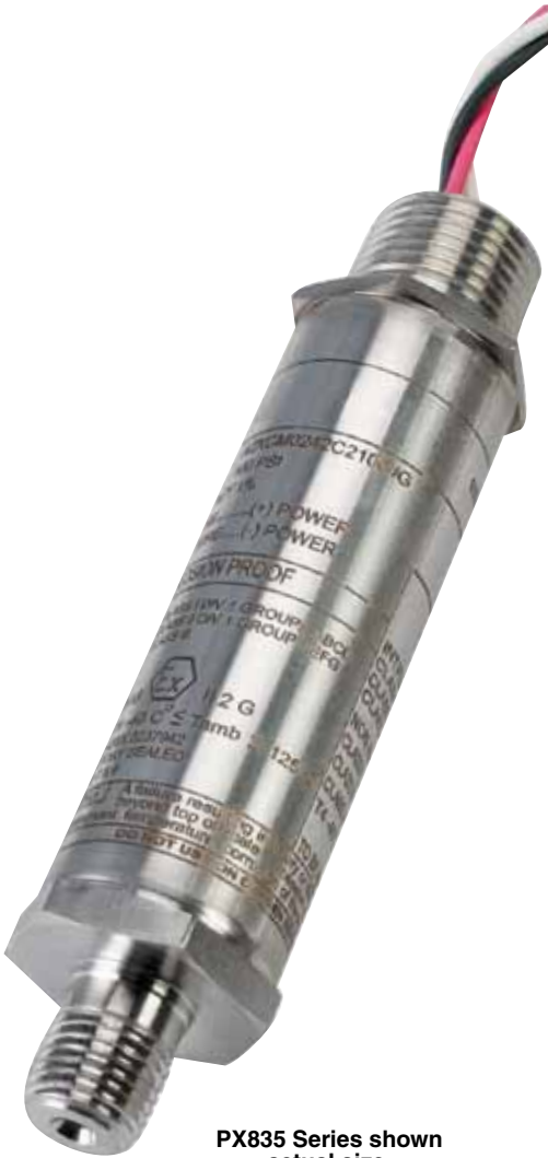
PX835 Series shown actual size.

To Order Visit omega.com/px835 for Pricing and Details