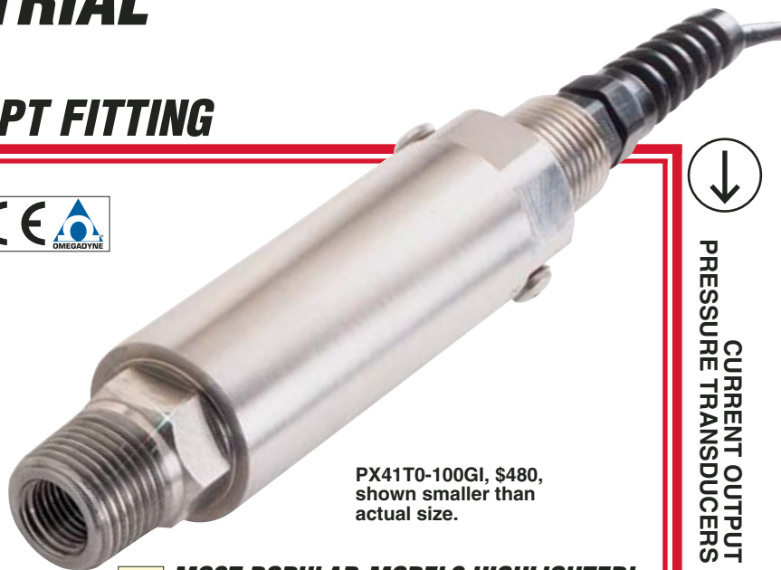
PX41T0-100GI, $480, shown smaller than actual size.