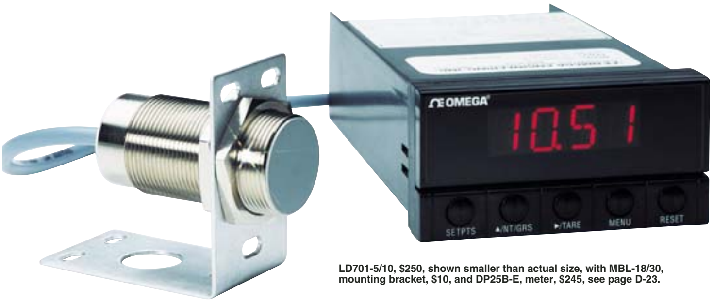
LD701-5/10, $250, shown smaller than actual size, with MBL-18/30, mounting bracket, $10, and DP25B-E, meter, $245, see page D-23.