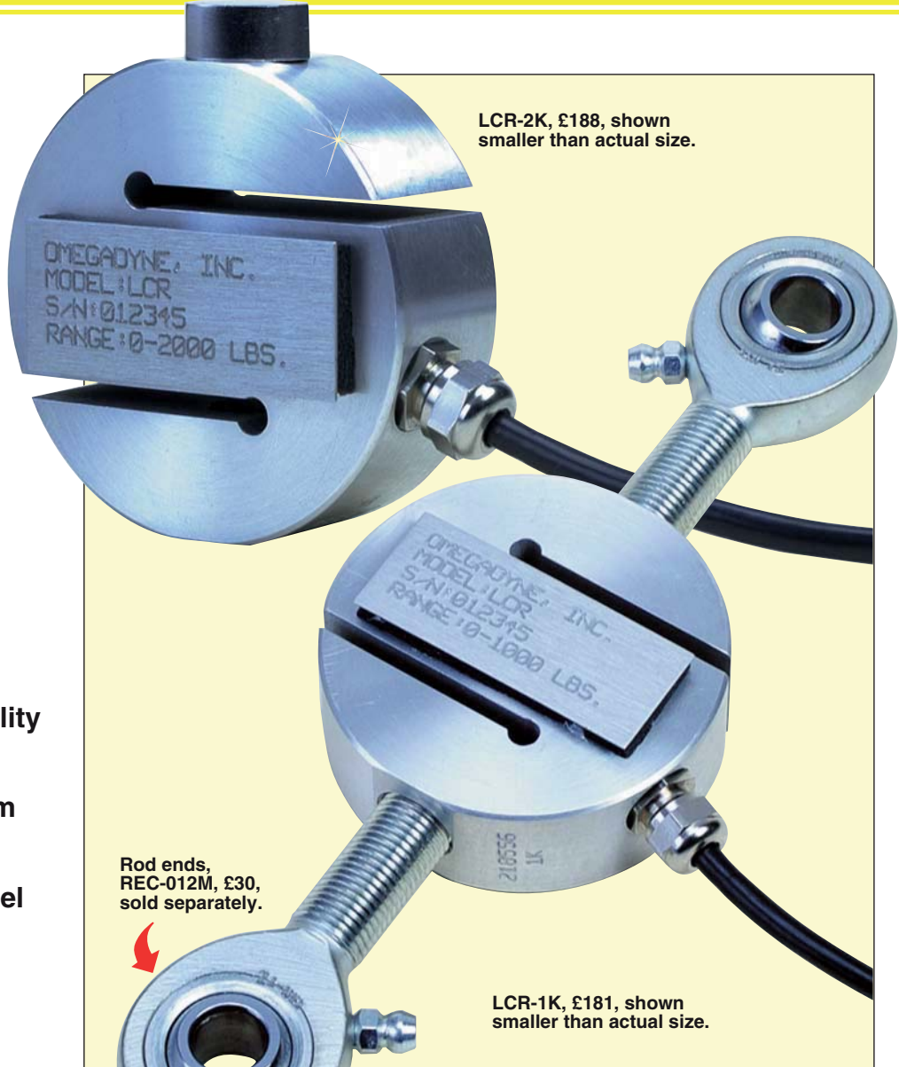
LCR-2K, £188, shown smaller than actual size.

Rod ends, REC-012M, £30, sold separately.