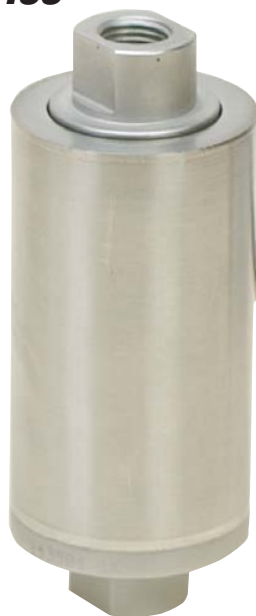
LCM701-50, £399, shown actual size.