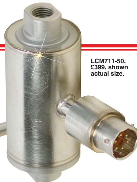
LCM711-50, £399, shown actual size.