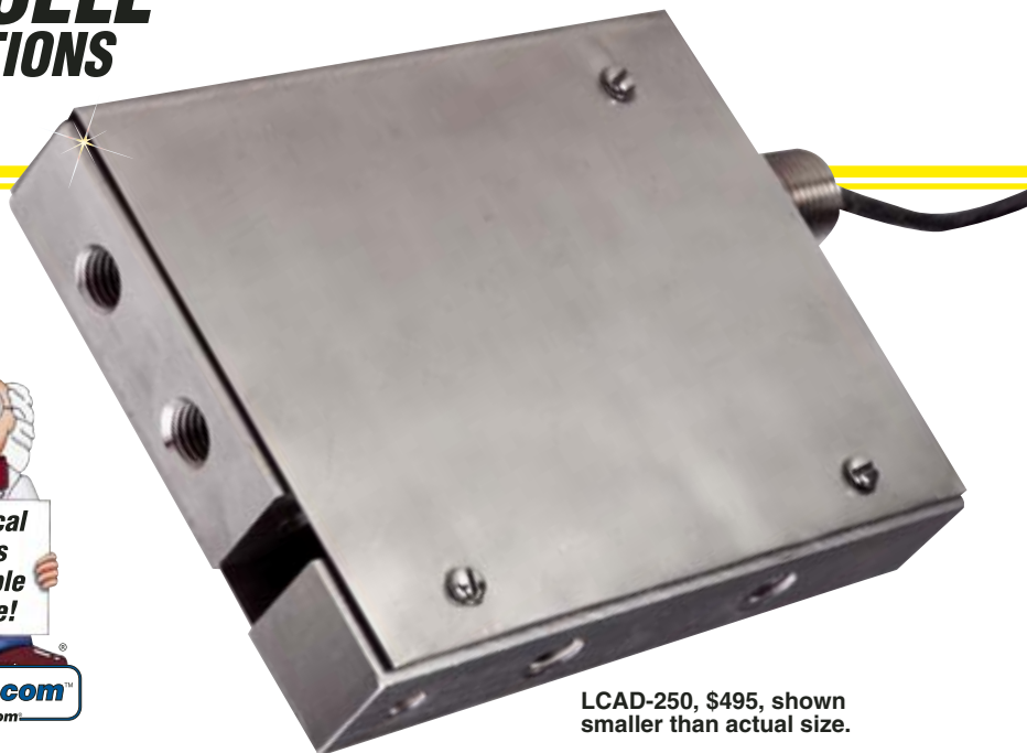
LCAD-250, $495, shown smaller than actual size.