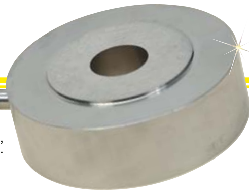
LC8200-500-250, $480, shown larger than actual size.