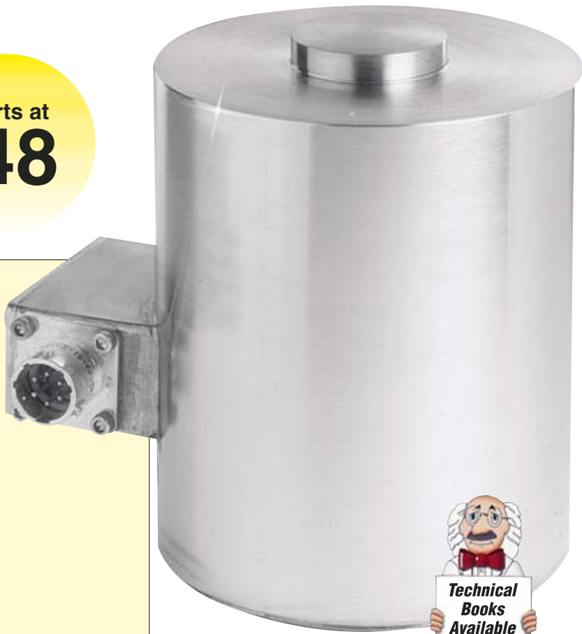
LC1011-10K, $895, shown smaller than actual size.