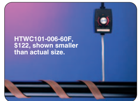
HTWC101-006-60F, $122, shown smaller than actual size.

Controller: Rugged and dependable percentage controller. Includes power cord and 2 prong plug