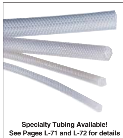
Specialty Tubing Available! See Pages L-71 and L-72 for details