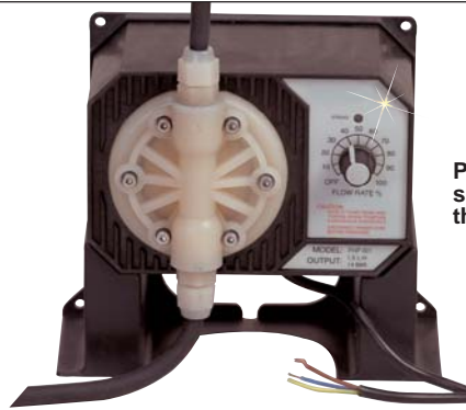
PHP-601, £151, shown smaller than actual size.