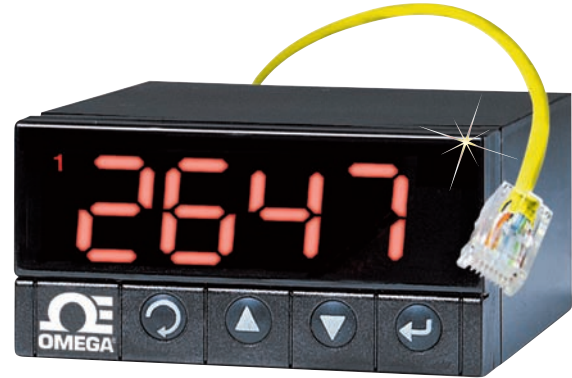
iSeries DPi8, $240, ordering information below. See page M-37 for details.