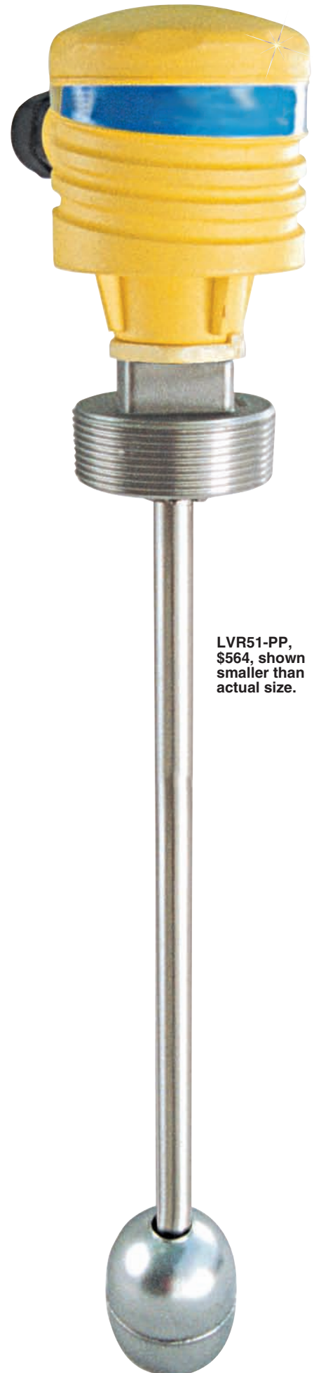
LVR51-PP, $564, shown smaller than actual size.