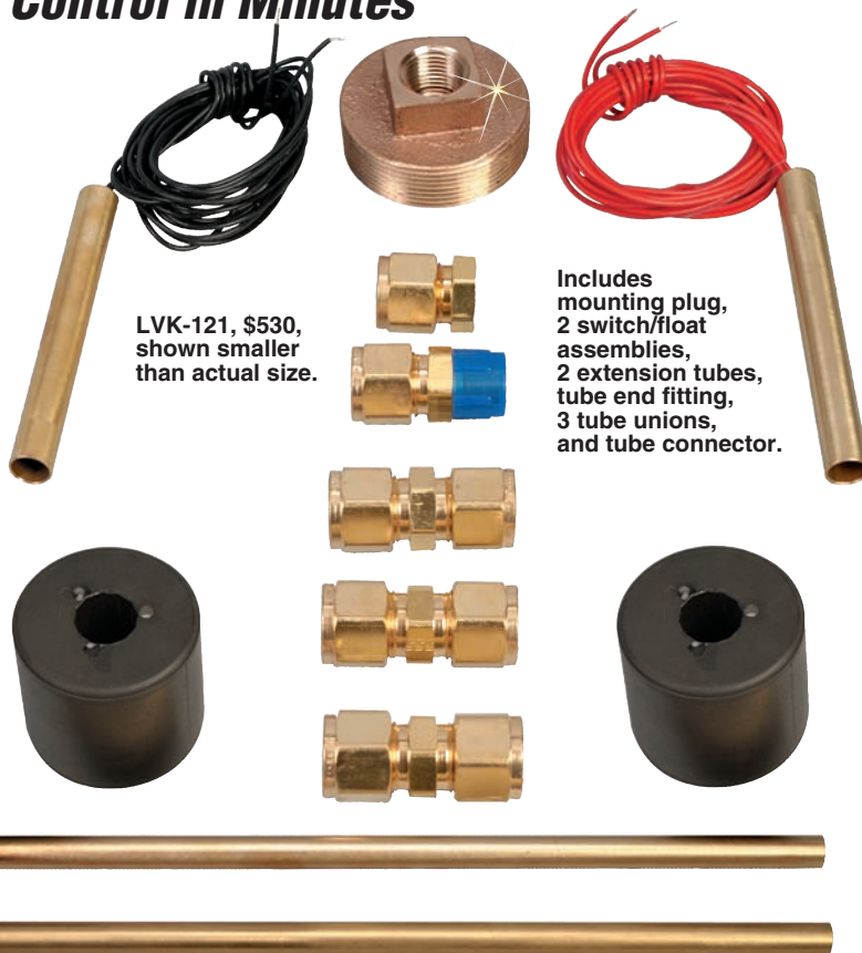
LVK-121, $530, shown smaller than actual size.

Includes mounting plug, 2 switch/float assemblies, 2 extension tubes, tube end fitting, 3 tube unions, and tube connector.