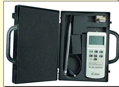
HHF42, £281, shown smaller than actual size.

Carrying case, operators manual and six "AAA" batteries included.