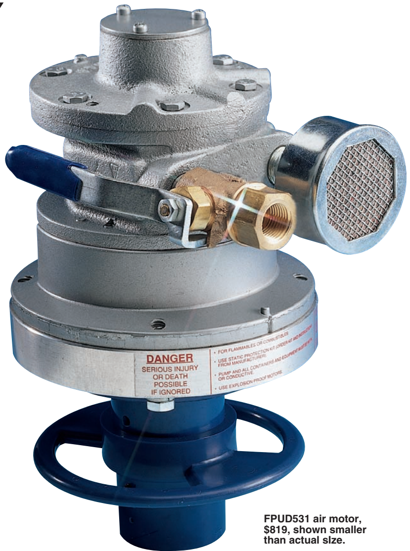
FPUD531 air motor, $819, shown smaller than actual size.

When pumping flammable or combustible materials, or working in explosive environments, use an air motor with a stainless steel tube and FPUD5-SK static protection kit.