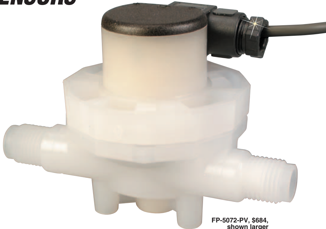
FP-5072-PV, $684, shown larger than actual size.

The OMEGA® FP-5070 Mini-Flow sensor is ideal for precision low flow monitoring. The FP-5070 is available in four flow range configurations, covering a very wide range of flows. This allows for easy selection of the range that best fits your application. Typical applications include pilot plant installations, monitoring of critical flows in laboratories, fluid dispensing, bottling lines, and medical flow applications. Other successful applications include monitoring liquid ingredient additions, such as food dyes, in the food processing industry.