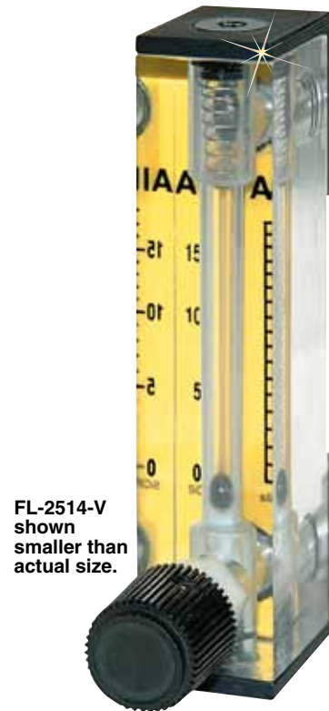
FL-2514-V shown smaller than actual size.

The FL-2500 Series direct read rotometer kits offer versatility at a low cost. Each kit includes seven interchangeable direct read scales for air, water, Argon, CO 2 , Helium, Nitrogen and Oxygen. These economical kits are ideal for laboratories, schools or processes that use multiple gases.