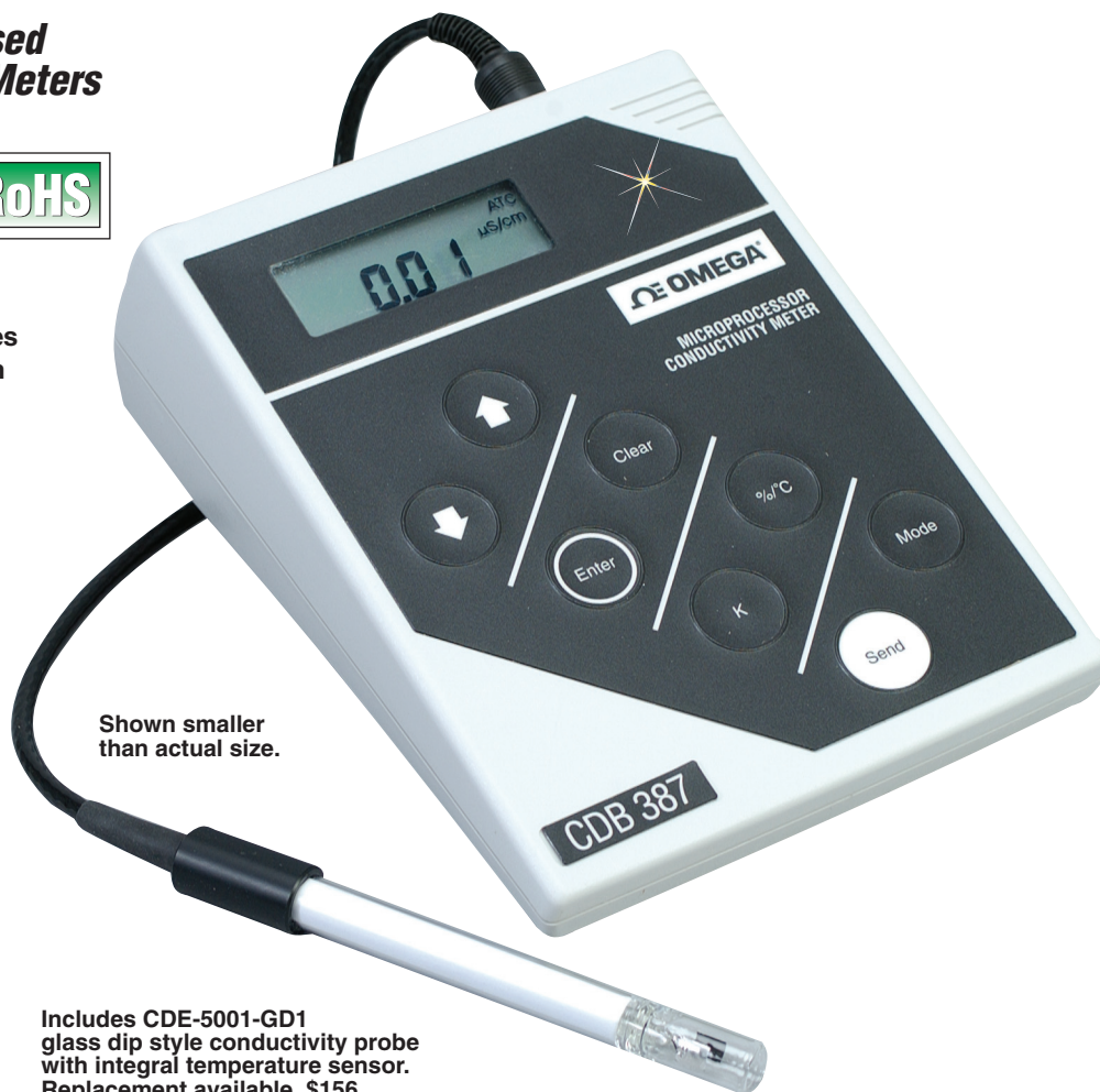
Shown smaller than actual size.

The CDB-387 operates off ac power or a 9V battery. The 9V battery serves as a back-up to retain calibration data, even in the event of a power failure, and allows for portable field measurements. The unit is supplied with a glass dip-style conductivity cell with an integral temperature sensor, K = 1.0 , calibration solutions and 9V adaptor.