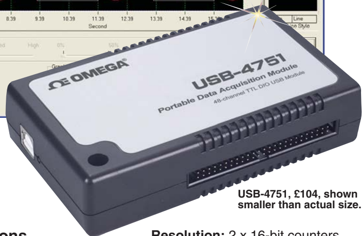
USB-4751, £104, shown smaller than actual size.

Windows software displays data in graphical or tabular format.