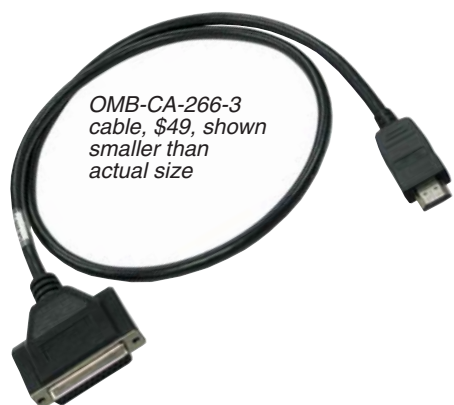
OMB-CA-266-3 cable, $49, shown smaller than actual size

When used with either host, the OMB-PDQ30 also adds thermocouple measurement capability, in which the A/D operates in a programmable, over-sample/digital filtering mode to provide low-noise and stable temperature measurements.