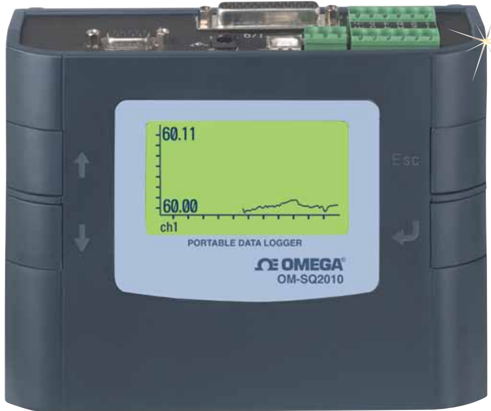
OM-SQ2010 data logger shown smaller than actual size.

The OM-SQ2010 is a versatile general purpose data logger with 4 to 8 analog input channels to measure current, voltage, resistance and temperature, plus 8 digital channels to automatically trigger or stop logging. An RS-232 port is included, allowing connection to modems and other networking devices.