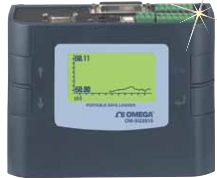
OM-SQ2010 data logger shown smaller than actual size.

OM-SQ-SOFT, Windows software (included with OM-SQ2010 data loggers) displays data in graphical or tabular format.