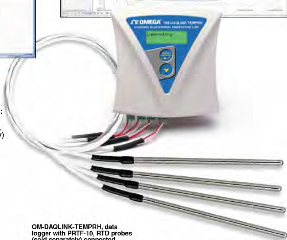
OM-DAQLINK-TEMPRH, data logger with PRTF-10, RTD probes (sold separately) connected. Visit omega.com/prtf-10 for more information.