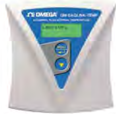
OM-DAQLINK-TEMP, data logger, shown smaller than actual size.

Minimum Hardware Requirements: Pentium 4, 2 GHz Processor or better, 512 MB RAM, 250 MB available disk space