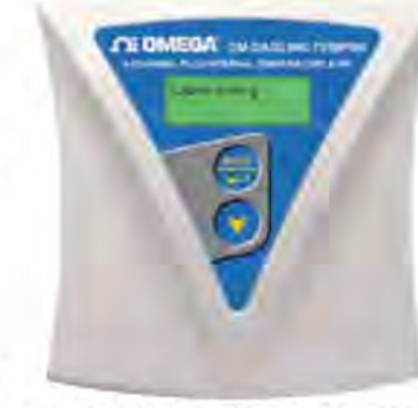
OM-DAQLINK-TEMP-RH, data logger, shown smaller than actual size.