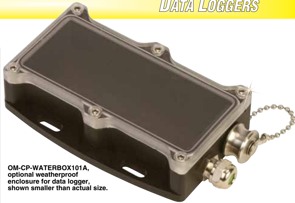
OM-CP-WATERBOX101A, optional weatherproof enclosure for data logger, shown smaller than actual size.

Password Protection: An optional password may be programmed into the device to restrict access to configuration options. Data may be read out without the password.