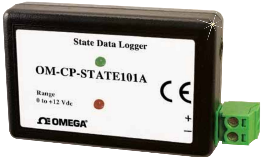
OM-CP-STATE101A shown larger than actual size.

The OM-CP-STATE101A is one of our newest data loggers. It is part of a new series of low cost, state-of-the-art data logging devices that has taken the lead in offering the most advanced, low cost, battery powered data loggers in the world today.