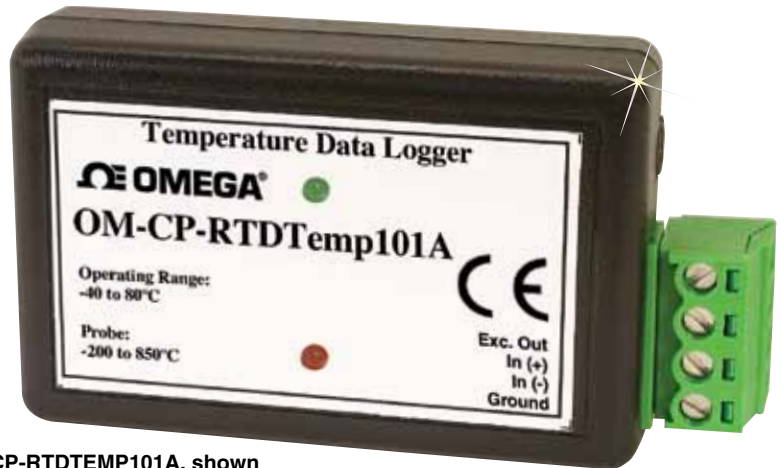
OM-CP-RTDTEMP101A, shown larger than actual size.

The storage medium is non-volatile solid state memory, providing maximum data security even if the battery becomes discharged. Its small size allows it to fit almost anywhere.