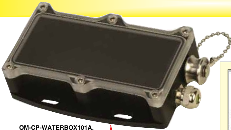
OM-CP-WATERBOX101A , optional weatherproof enclosure for data logger, shown smaller than actual size.

Red LED Blinks: 10 second rate to indicate low battery and/or full memory; 1 second rate to indicate an alarm condition