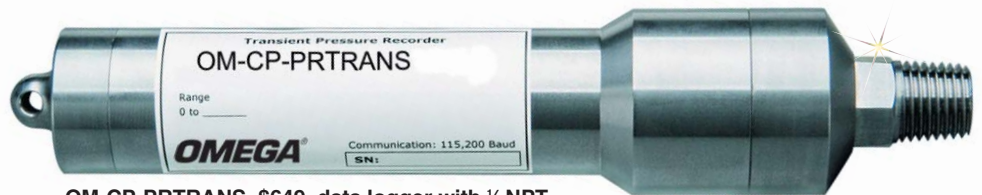
OM-CP-PRTRANS, $649, data logger with 1/4 NPT fitting, shown smaller than actual size

The OM-CP-PRTRANS is your solution to the transient pressure problem.