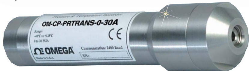
OM-CP-PRTRANS, $649, fully submersible data logger, shown smaller than actual size