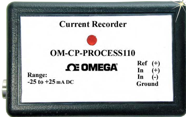
OM-CP-PROCESS110-25MA, £200, data logger shown larger than actual size