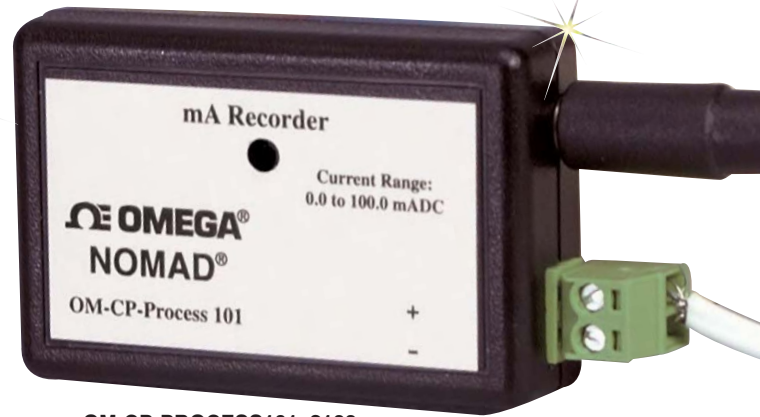
OM-CP-PROCESS101, £133 data logger shown larger than actual size