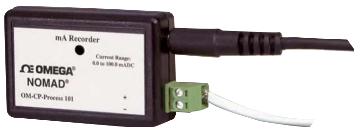
OM-CP-PROCESS101, £133, data logger shown larger than actual size