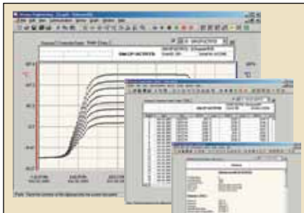
OM-CP-IFC200 Windows software displays data in graphical or tabular format

Measurement Range: -200 to 850°C (-328 to 1562°F)