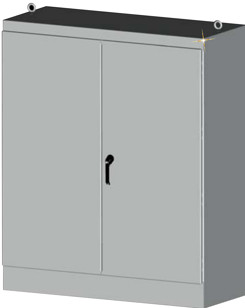
SCE-724824FSDAD, $2551, shown smaller than actual size.