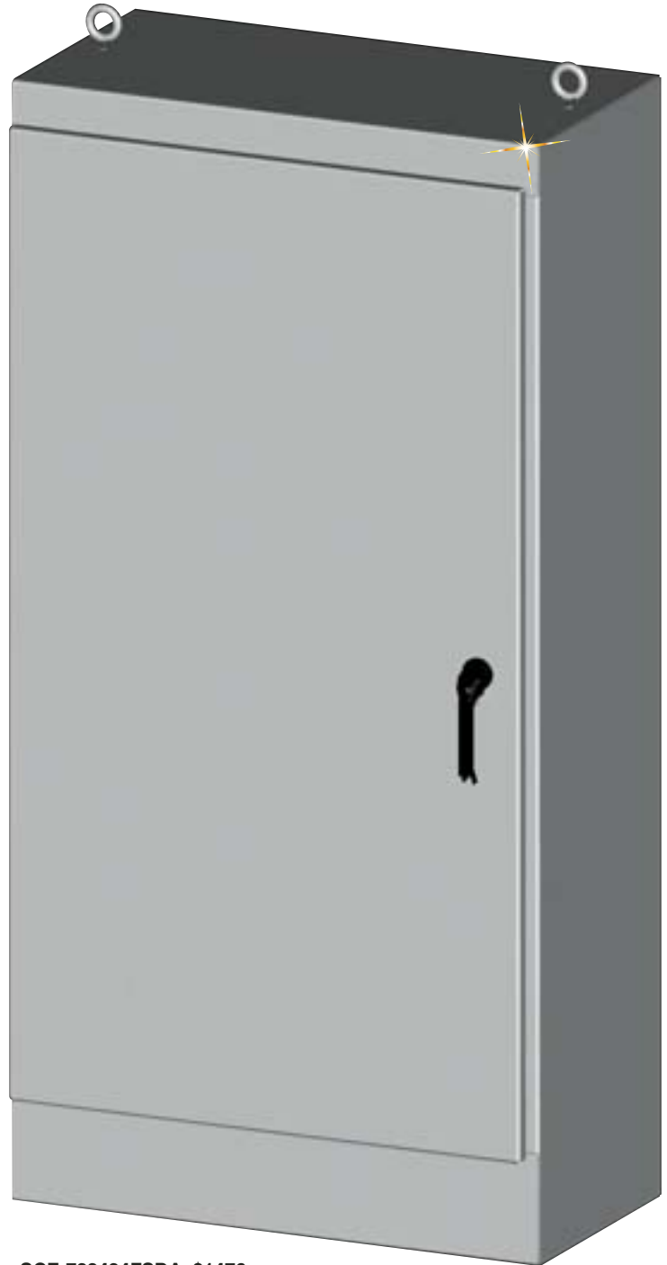
SCE-722424FSDA, $1476, shown smaller than actual size.

NEMA Type 12 & Type 13 UL Listed Type 12 CSA Type 12 IEC 60529 IP 55