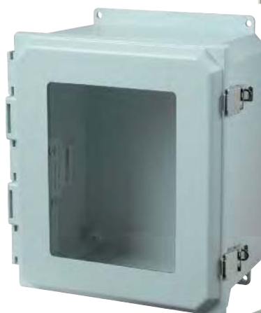
OM-AMU1426LWF raised front fiberglass enclosure with stainless steel hinge, padlocking snap latch, viewing window and mounting flange, £127.