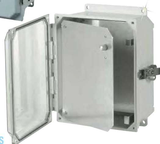
OM-AMU1084TCCF fiberglass enclosure with molded-in hinge, clear polycarbonate window and padlocking twist latch, £66. Shown with OM-HFPU108, front dead panel sold separately, £29.00.