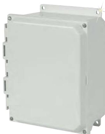
OM-AMU664F solid cover fiberglass enclosure with 4 screw closure and factory installed mounting flange, £37.50.

All models shown much smaller than actual size.