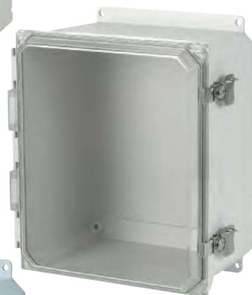
OM-AMU1206TCCF fiberglass enclosure with molded-in hinge, clear polycarbonate cover, padlocking twist latch and mounting flange, £78.

All models shown much smaller than actual size.