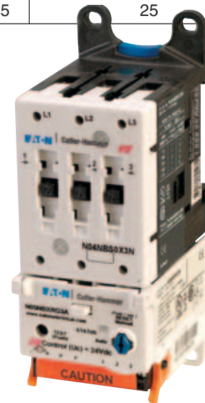
N101BS0G3A, $410, shown smaller than actual size.