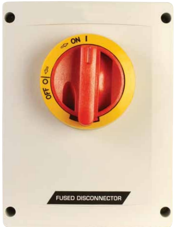
AU-KKVM332-YR front panel.