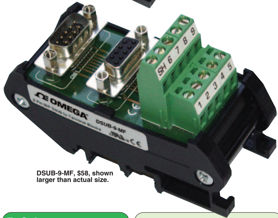
DSUB-9-MF, $58, shown larger than actual size.

The DSUB Series of DIN rail mounted interface modules provides a reliable “plug and play” interface for any industrial control system. Users can attach field wiring from the terminal blocks to their industrial control panel and then simply plug in their controller. These modules come with both male and female D-sub connectors for maximum flexibility.