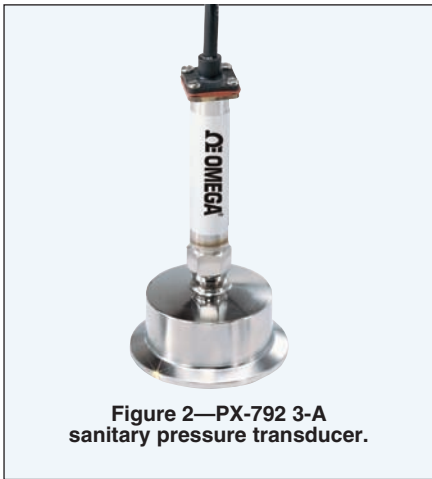
Figure 2—PX-792 3-A sanitary pressure transducer.

Figure 2 shows a 3-A sanitary pressure transducer. This device is typically used in dairy, food processing, pharmaceutical, and biotech applications. Construction is all stainless steel with an electro-polished finish. This unit is designed for clean-in-place operation. This sensor utilizes thin-film technology which is known for reliability and accuracy. It is calibrated to NIST standards. The low response time of 5 msec ensures tight process control. The reading is delivered via a 1 to 5 Vdc output signal or a 4 to 20 mA current loop.