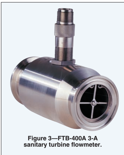
Figure 3—FTB-400A 3-A sanitary turbine flowmeter.

Sanitary turbine flowmeters, such as the unit shown in Figure 3, are used in processing liquids and beverages. They are also found in applications requiring pasteurization and can be used for thicker materials such as ketchup and chocolate. Units are available in sizes ranging from ¼ to 3" in diameter. This type of sensor covers flow ranges from a fraction of