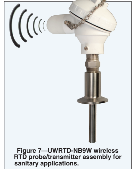
Figure 7—UWRD-NB9W wireless RTD probe/transmitter assembly for sanitary applications.

well as add analytical and control software to improve process control and monitoring. Figure 7 shows an RTD-to-wireless unit that transmits measurements to a matching receiver that can handle up to 48 channels. Matching software logs data and provides process control signals.