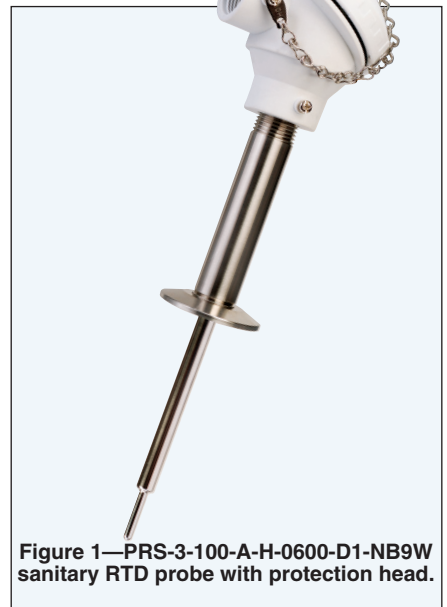
Figure 1—PRS-3-100-A-H-0600-D1-NB9W sanitary RTD probe with protection head.

The most accurate and most popular device for process temperature control is the RTD (resistance temperature detector) Figure 1. An RTD that meets 3-A sanitary standards can be provided in the form of a probe for direct immersion (and faster response time) or can be enclosed in a thermowell for mechanical protection and ease of replacement. Direct immersion RTD sensors are provided with straight or stepped probe designs depending on response time and process flow conditions. The wetted surfaces are 316L stainless steel, and are highly polished to meet 3-A requirements. These sensors are also supplied with traditional connection heads, M12 connections, integral extension cables or wireless features for ease of installation.