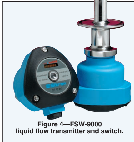
Figure 4—FSW-9000 liquid flow transmitter and switch.

The Model FSW-9000 transmitter/switch shown in Figure 4 monitors the flow velocity of the product based on the principle of thermal dispersion between heated and unheated RTDs immersed in the product. It generates an analog output signal corresponding to the flow rate and includes a set point feature which can signal a process controller or operator when a specified flow is achieved. If an actual flow measurement is not required, a simpler flow switch can be used to signal when the flow rate set point is reached.